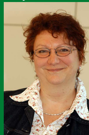
Placement of internships Services